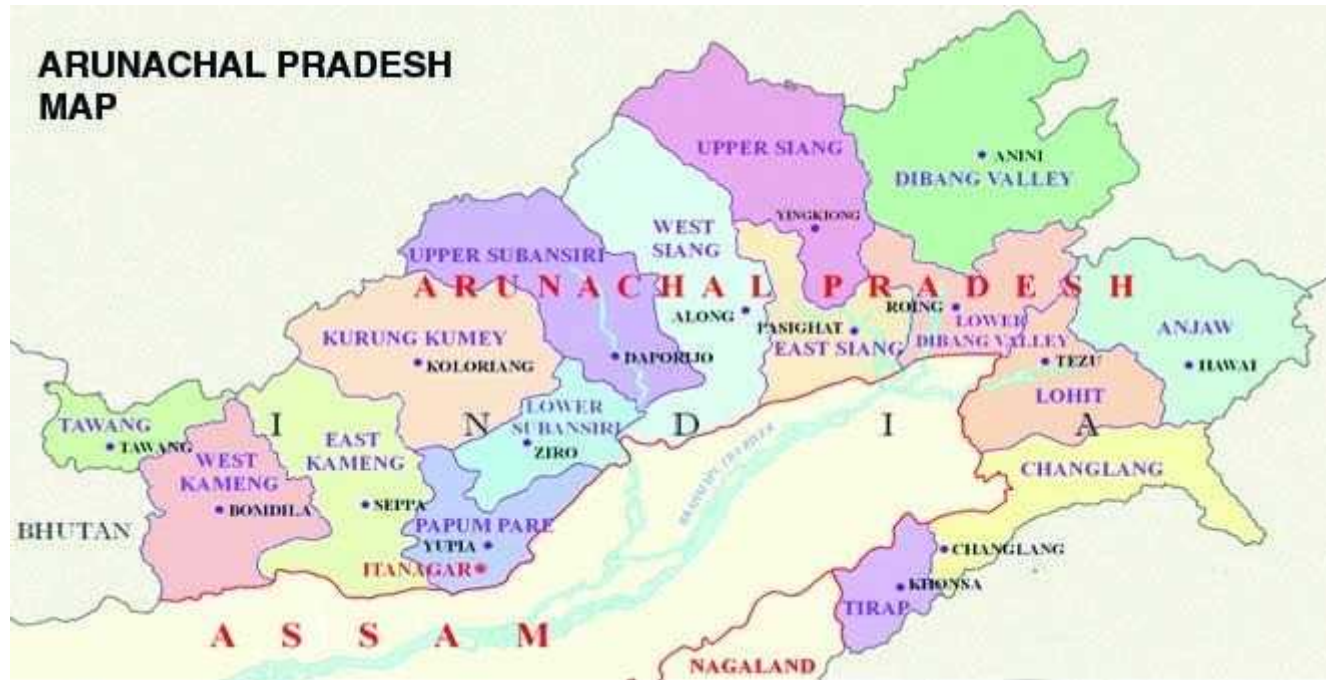
Annexure – 1: LOCATION MAP OF LOWER SUBANSIRI DISTRICT OF ARUNACHAL PRADESH