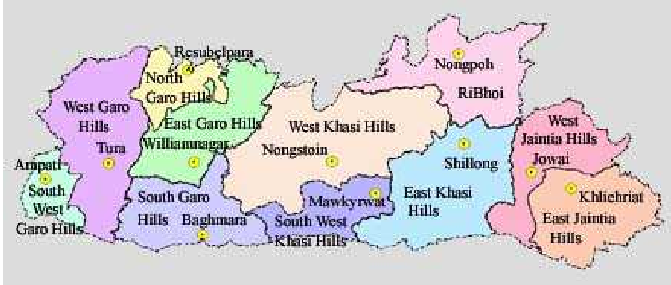
Location map of East Jaintia district Annexure I