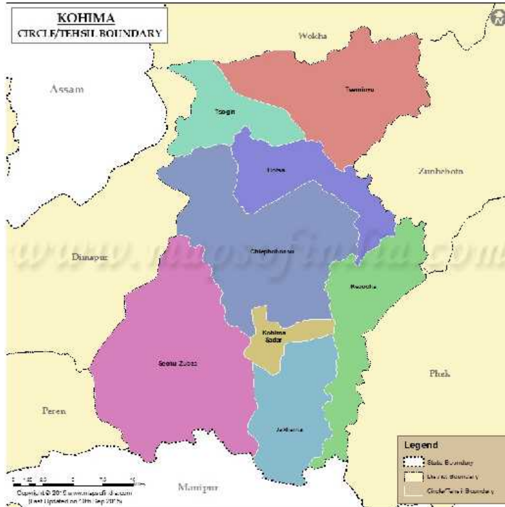
Annexure – 1: Location map of Kohima district