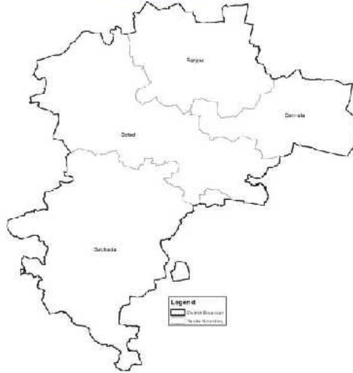
Map of Dated District