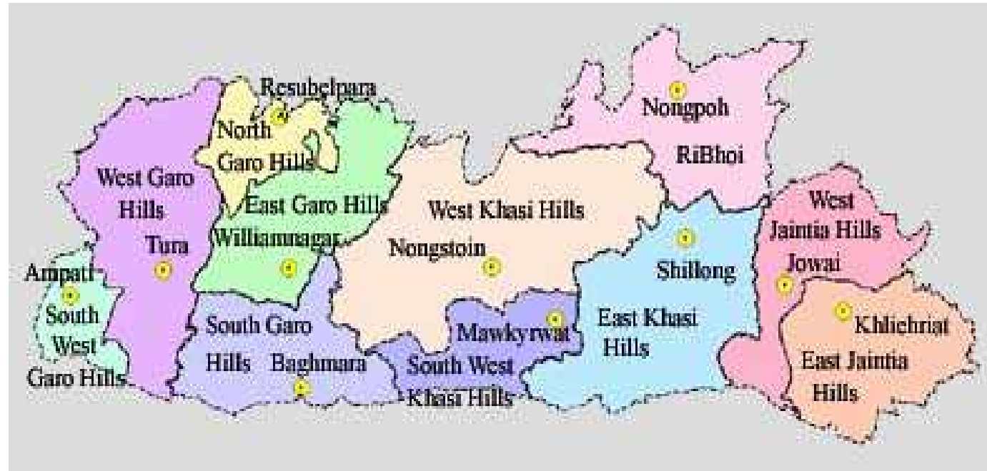
Location map of South West Khasi Hills district Annexure I