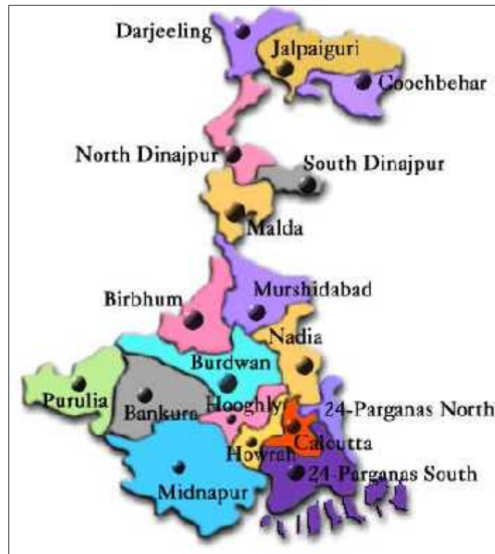
Location map of jalpaiguri district